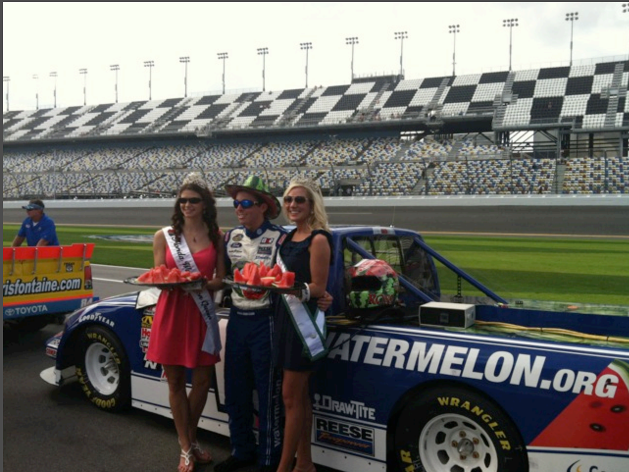
Watermelon Queens with Ross Chastain during qualifying for the NASCAR CAMPING WORLD TRUCK SERIES Next-Era Resources 250 Race