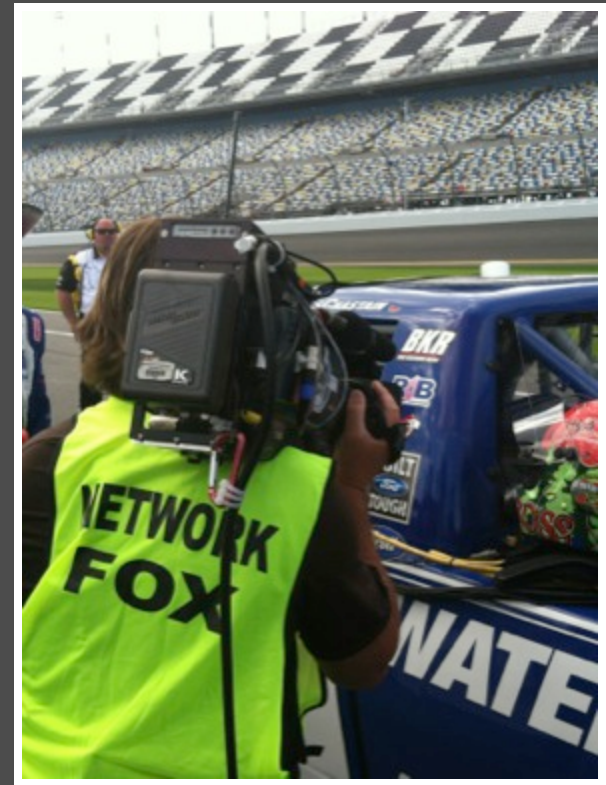
LIVE SPEED/FOX TV BROADCASTING