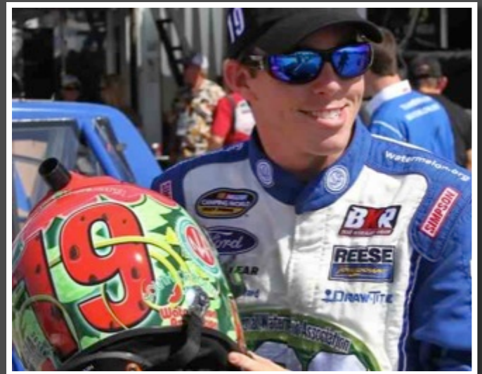
A melon for his melon!