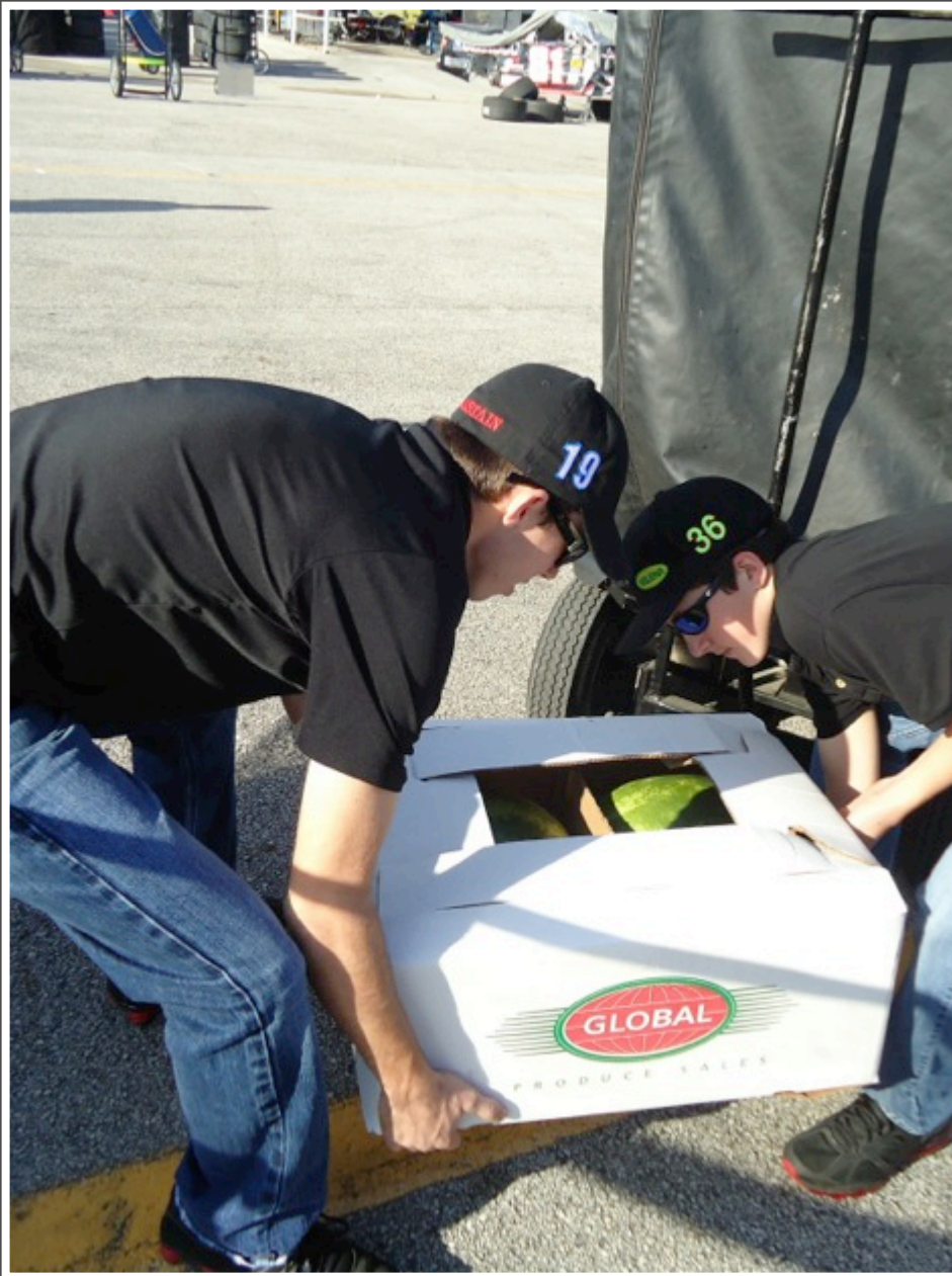
Preparation around the track