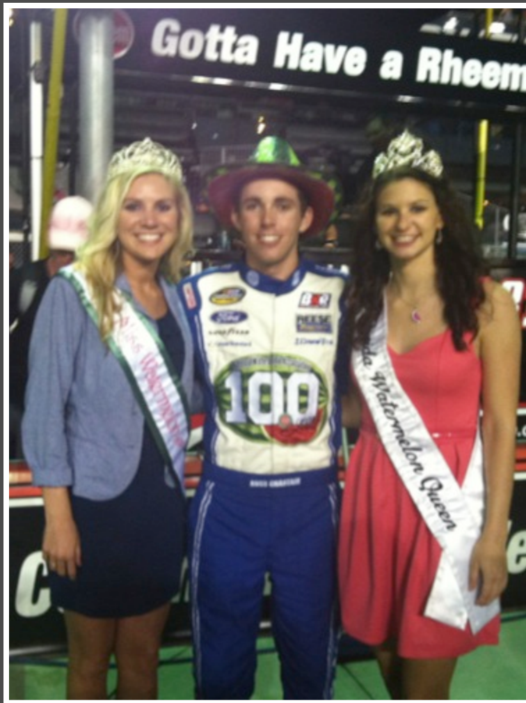
NASCAR fans enjoying Watermelon