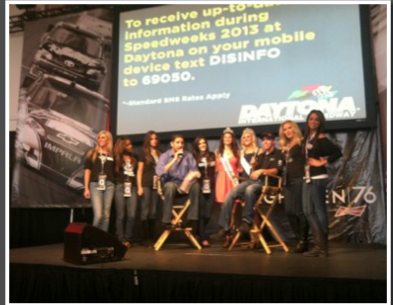
NASCAR Autograph Session & Fox Sports Girls interview with Ross Chastain at the Daytona International Speedway VIP Club