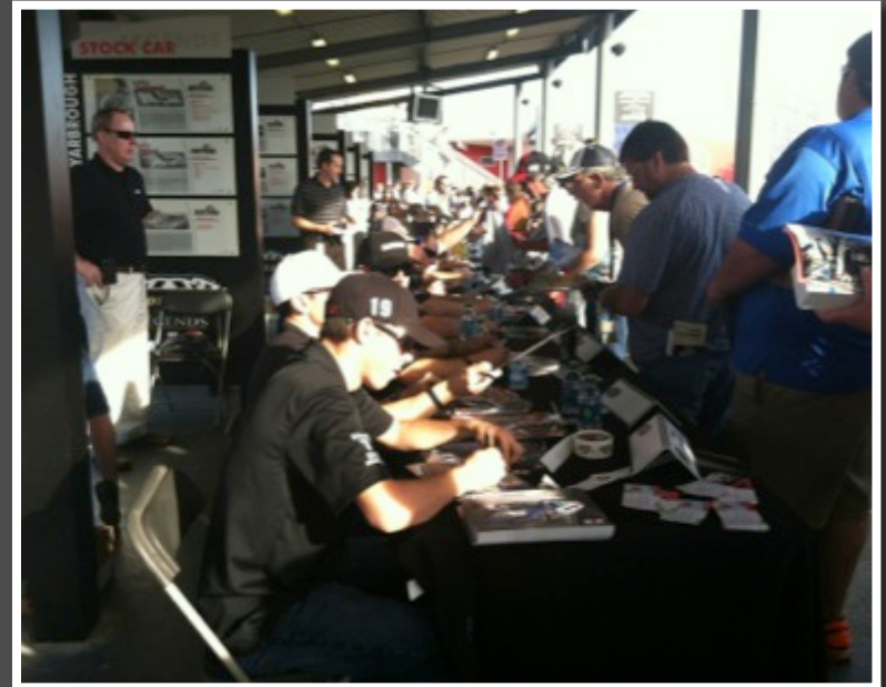
NASCAR Autograph Session