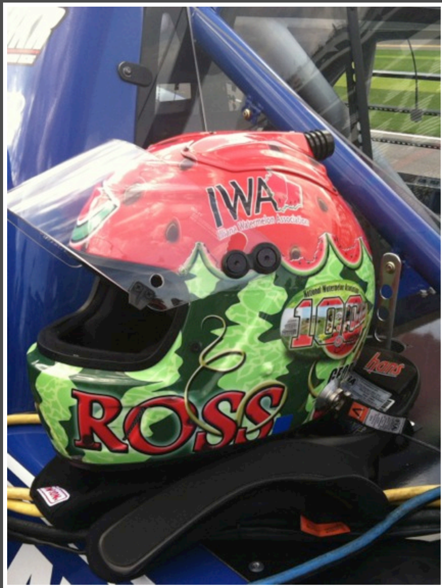
Ross always supporting Watermelon awareness