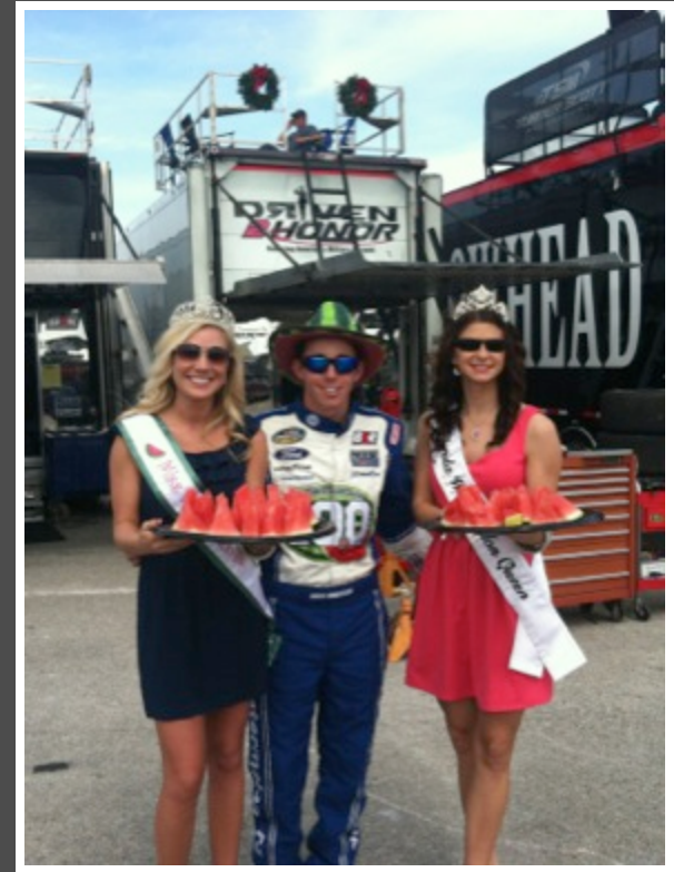
NASCAR garage activities and LIVE SPEED TV broadcasting .